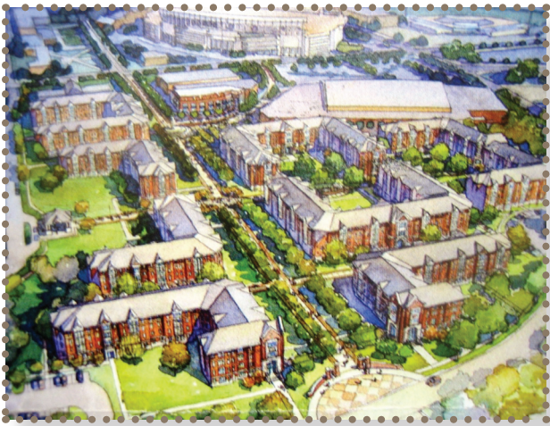
“The Village”, Wallace Center top center left, new basketball arena top center right.

The Department of Industrial Design currently supports 17 faculty, 250 undergraduate, 15 graduate, 5 post baccalaureate students, and 5 full time technical and administrative staff. The degrees offered within the department are: Bachelor of Industrial Design, Bachelor of Fine Arts in Graphic Design, Bachelor of Science in Environmental Design (post baccalaureate degree), and Master of Industrial Design. All degrees are accredited by the National Association of Schools of Art and Design. The INDD Endowment currently stands at $400,000, thanks to the industry collaboration work accomplished by INDD faculty and students and to the generosity of our alumni.