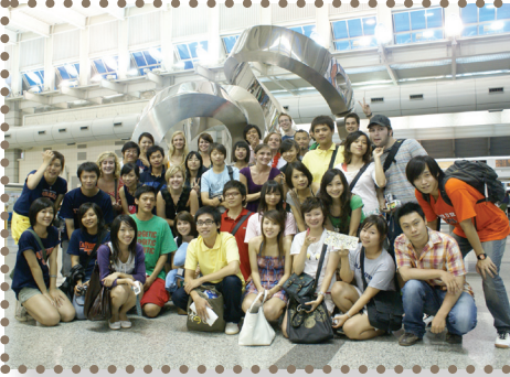
Taiwan Program Summer Semester 2008, Auburn and Shu-Te University students.