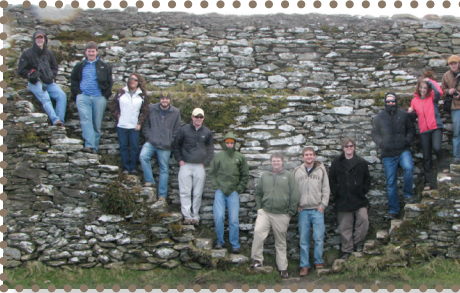
Ireland Program Spring Semester 2008