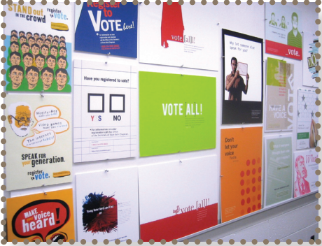
Motor Voter Registration Posters.