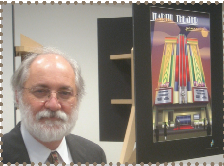
American Streamlined Design exhibition, Ray Dugas , poster by Jessica Sabo .

to Iconologic Design, Altanta, GA, and accomplished other art media and logo consultation. He also submitted logo designs for consideration in the “Identity: Best of the Best for 2008 World-Wide Corporate Identity Competition” and had a number of logo designs published on the LogoLounge web site.