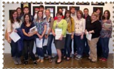
GDES Spring Juried Show Participants.

• The 5th Annual Designing Green was a great success, thanks to the effort of our IDSA / AIGA student chapters, faculty and staff.