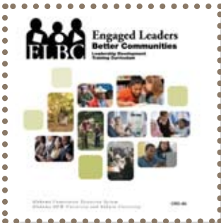
Engaged Leaders Better Communities, Leadership Development Training Curriculum, ACES-publication/book design