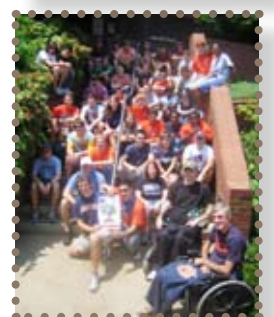
World Industrial Design Day at Wallace Center