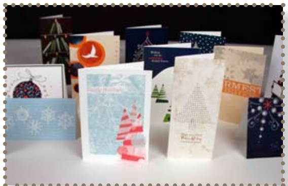
GDES student Holiday Card designs