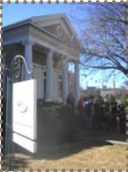
Terry Slaughter / son and GDES students / faculty