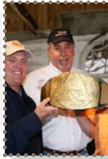
Boda Getta BBQ Awards