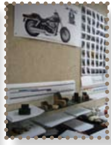
HD Paint Concept