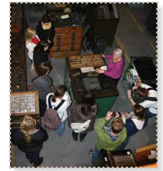
Graphic Design students at the National Print Museum in Dublin, Ireland