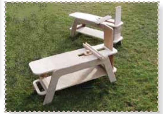
Stackable life drawing bench