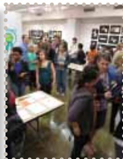
GDES Juried Show