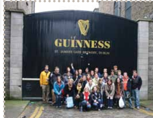
Spring 2010 Department of Industrial and Graphic Design students Guinness Storehouse field trip in Dublin, Ireland