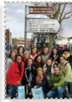
Students at Dublin's National Print Museum