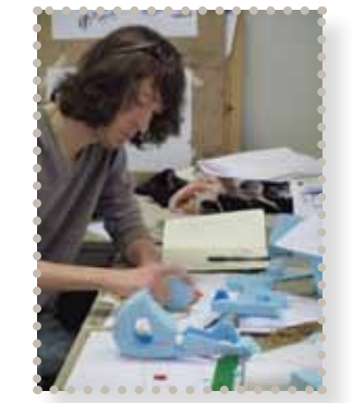
Industrial Design student at work at the National College of Art and Design