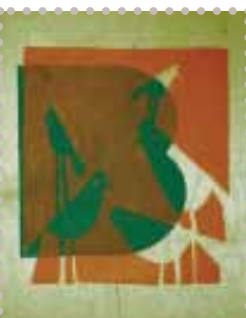
Betsy Munger's press image