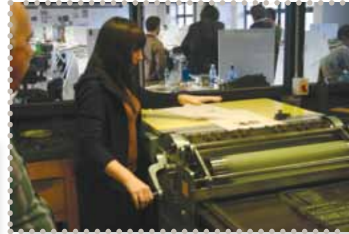
Letterpress workshop at the National College of Art and Design in Dublin, Ireland