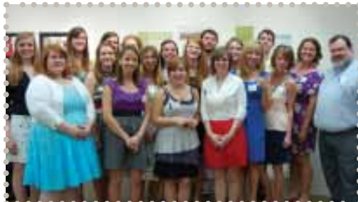
Senior Show participants

The GDES Senior Show review requires extensive commitment by faculty. Preliminary reviews and final selection support our students in exhibiting their highest level of achievement upon completion of the curriculum.