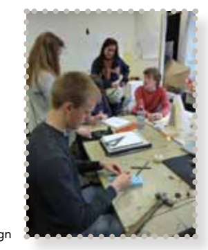
Industrial and Graphic Design students at work at the National College of Art and Design