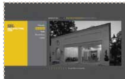
Andy Smith Architecture web site