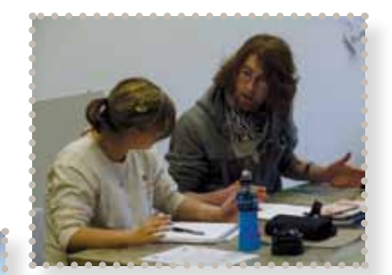
Industrial Design students at work at the National College of Art and Design