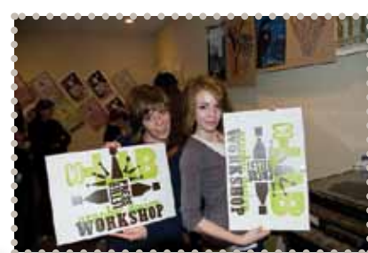
COLAB field trip to local letterpress studio