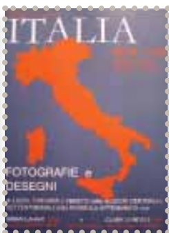
ITALIA exhibition poster