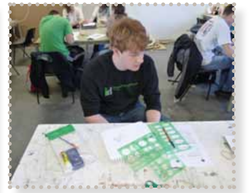
Department of Industrial and Graphic Design students at the National College of Art and Design