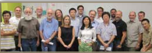
DIGD Faculty Fall 2012

• During the first faculty meeting of each academic year DIGD documents the current faculty supporting our industrial and graphic design programs.