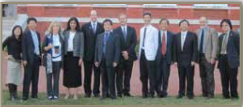
Dignitaries from AU and the National Cheng Kung University, Taiwan

In addition to our industry collaborators and speakers, every semester DIGD hosts a number of special visitors to Auburn and Wallace Hall. See the following small sample: