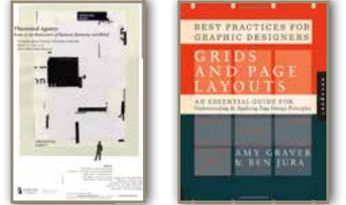
Theoretical Agency Poster Grids and Page Layouts

Also, Kelly's work was selected to be included in the text: Best Practices for Graphic Designers: Grids and Page Layouts , a graphic design text published by Rockport Publishing. Within the text are examples of design work that clearly exemplify the criteria for grid usage within design. The 2009 poster for the Department of Industrial + Graphic Design's 31st Annual Design Interaction Symposium was selected. (An international call for submissions, only 70 were selected).