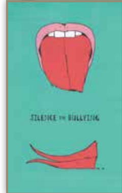
Silence the Bullying poster