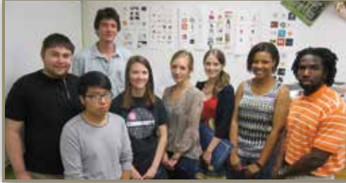
DIGD Studio Prize Winners

• Two DIGD cross disciplinary student groups are very important to the operation of the department. The first are the DIGD Studio Prize winners, selected each semester, who represent the spirit of excellence we hope to instill in all our students. The second is our DIGD Student Advisory Council who makes significant contribution to the operation of the department over the academic year.