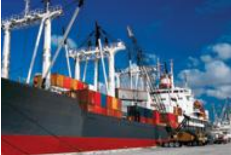
Costs/Benefits of trade