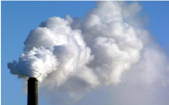
Cost of pollution