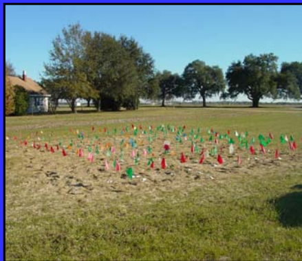
N remaining in peanut residue at NC