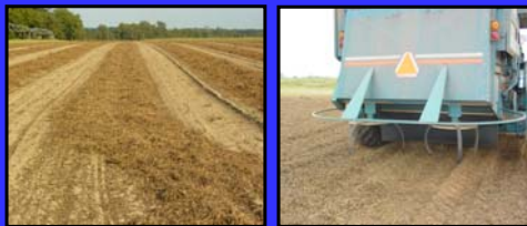
N release from Peanut Residue at Rocky Mount, NC