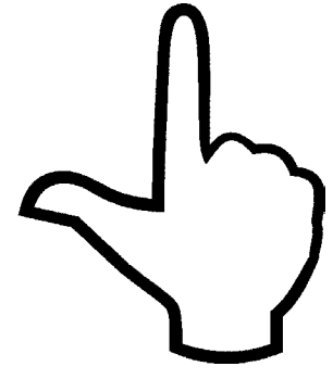
Figure I-5: Graphic of a Strategy Teachers Use to Teach Children Left from Right

Although being able to quantify how feedback aids student learning is of continual debate among teaching professionals, it is universally accepted that feedback does have an influence on student performance. This is evidenced when children are performing tasks and you provide them with some information about the quality or outcome of the performance. It is believed that children use your information to make adjustments to subsequent practice tasks. There are numerous types of feedback used by teachers to aid performance that include but are not limited to: positive, negative, approval, disapproval, general, specific, supportive, and congruent. It is generally accepted by many physical education professionals that most useful type of feedback given during instruction is specific and congruent. That is, specific feedback highlights what needs to be corrected and congruent feedback means that it relates to the learning cue or critical features of the skill identified during the lesson objective.