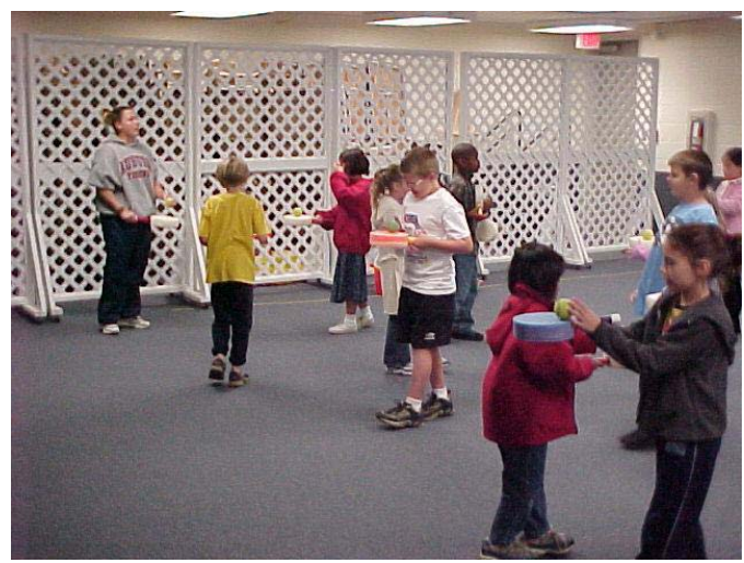
Figure 1-4. Quality Lessons Engage All Students

Being able to provide meaningful feedback is another characteristic of effective teachers. Think about the last time you tried to teach a person a new concept or skill. When the person was experiencing trouble, what did you do? You probably offered a few hints or clues that you thought might help them to learn the information better. For example, one common theme taught by most elementary