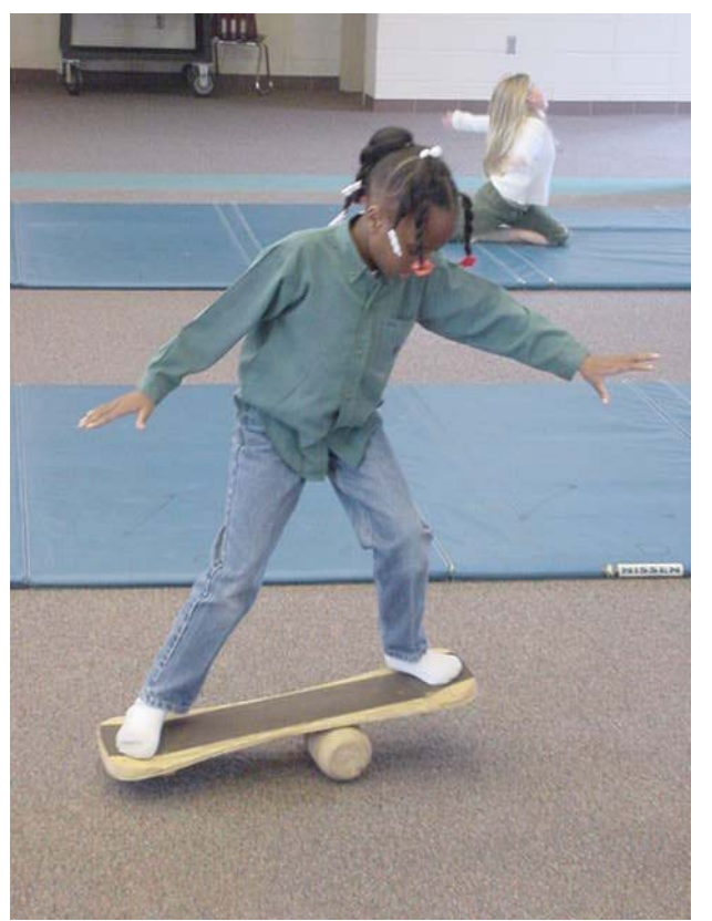
Figure 1-2. Children Need to Believe they "Can"

The root of many negative experiences in physical education which caused the subject to become the bane of some children's existence can usually be traced back to poor teaching practices and poor content development. Regrettably, some children would benefit from not having physical education if the program uses inappropriate teaching practices and content. These programs typically turn children "Off" physical activity and convince them they are not good at sports. Children in these programs become learned helpless. That is, they feel they lack the requisite skills to be successful, so they fail to try. This feeling is most evident when you hear a child say, especially the younger ones, "I can't." Unfortunately, children learn this behavior quickly after repeated failed attempts to be successful at a task and then quickly learn how to avoid experiencing the feeling of frustration in the future, by giving up before trying.