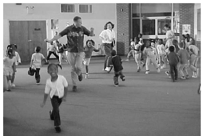
Figure 1-1. Active Children

We believe that in order for children to achieve the goal of being physically active for a lifetime, the physical educator must help children: