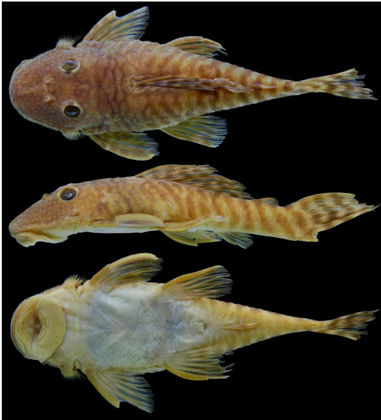
FIGURE 1. Dorsal, lateral and ventral views of holotype of Pseudancistrus reus , MCNG 18447, 72.2 mm SL.

except P. genisetiger and P. papariae by having an incomplete mid-dorsal plate row with 18 plates (vs. a complete mid-dorsal row with 21–25 plates). In the one specimen of P. genisetiger examined and the holotype of P. papariae , the mid-dorsal row has 14 plates, then a break around the adipose fin and then two more plates at the posterior end of the caudal peduncle (vs. 18 continuous plates in P. reus ). The other specimen of P. papariae (AUM 20768) examined had a complete mid-dorsal row (the plate rows were not examined on the paratypes).