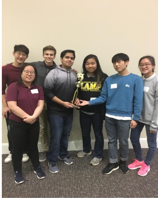
1 st Place: Team Sierra-Enterprise High School (1,561.9 points)