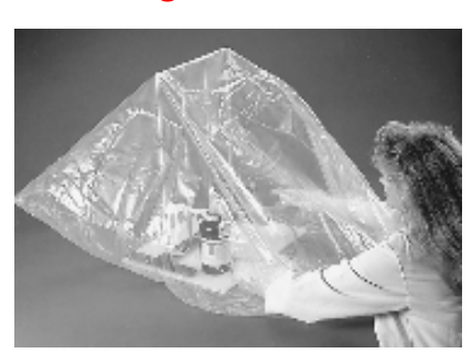
Two-hand AtmosBag shown here with Benchrack lattice system.

The Aldrich AtmosBag is a 0.003-in. gauge PE bag that can be sealed, purged, and inflated with an appropriate inert gas, creating a portable, convenient, and inexpensive "glove box" for handling air- and moisture-sensitive, as well as toxic, materials. Other applications include dust-free operations, controlled-atmosphere habitat, and, for the ethylene oxide-treated AtmosBag, immunological and microbiological studies. Small AtmosBags have one inlet per side. Includes instructions.