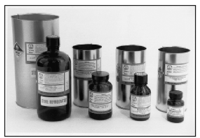
Fig. 1 Pyrophoric reagents may be packed in a variety of containers.