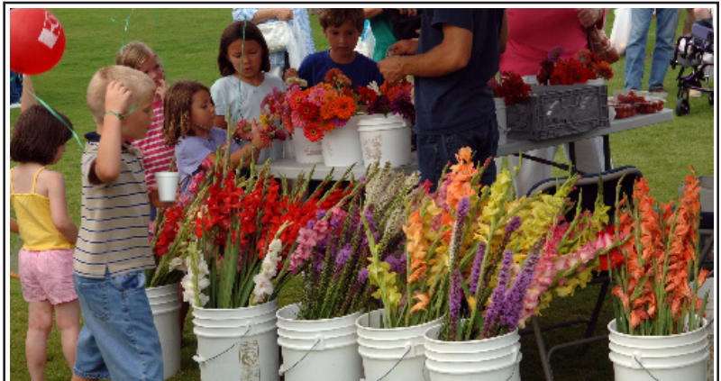
A farmers’ market offering fresh locally grown produce and a way to while away Thursday afternoons opened June 30 at AU’s Ag Heritage Park. The market is an effort by several groups interested in providing new markets to Alabama farmers and new sources of Alabama produce to consumers.