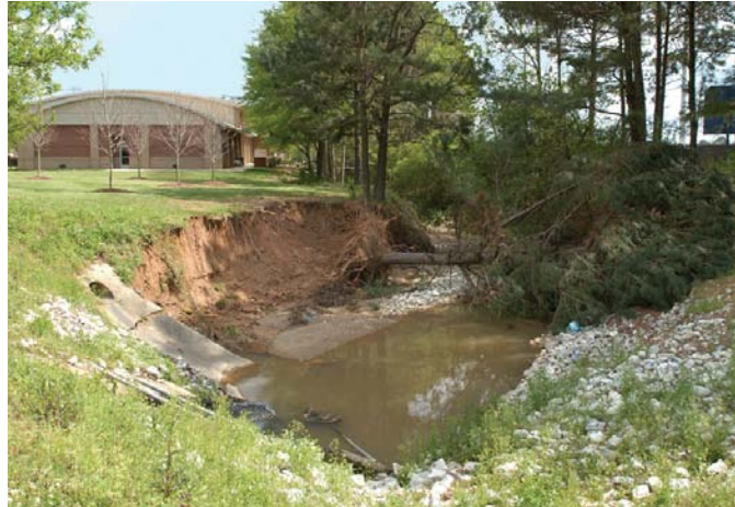
Parkerson Mill Creek