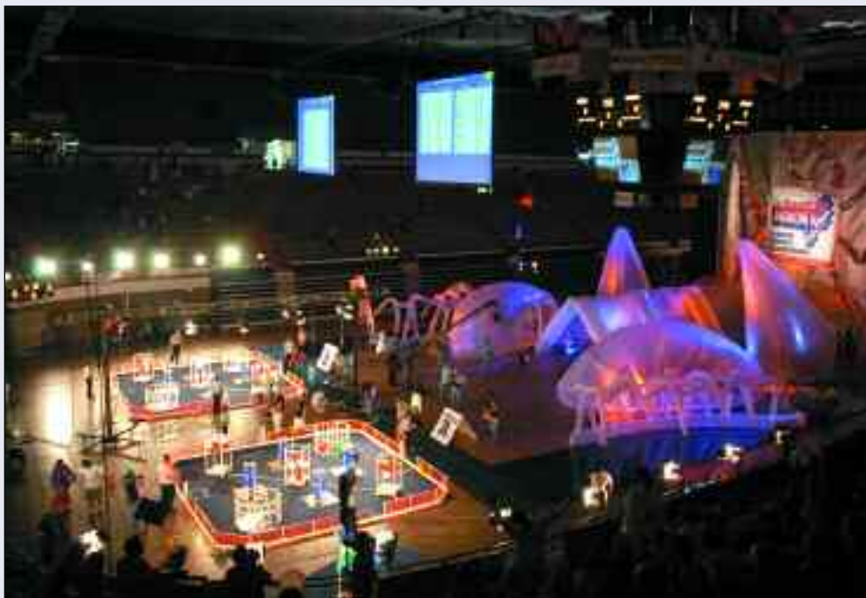
ROBOTS GALORE —Teams of high school students from across the East came to Beard-Eaves-Memorial Coliseum, in November for the South’s BEST robotics competition. The Samuel Ginn College of Engineering and College of Sciences and Mathematics sponsored the event. BEST (Boosting Engineering Science and Technology) is a non-profit volunteer organization that links educators and industry to inspire students to pursue careers in engineering, science and technology through participation in a sports-like, science- and engineering-based robotics competition. For more information log on to www.southsbest.org

“This new technology transfer venture is exciting, and may provide much needed new revenues to the university.”