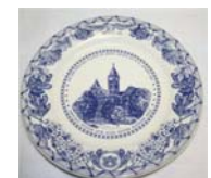
Varsity China 281-292-1896

To see more new products visit www.auburn.edu/trademarks