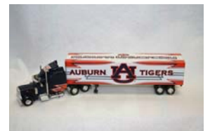
Upper Deck Collectibles 856-638-0614