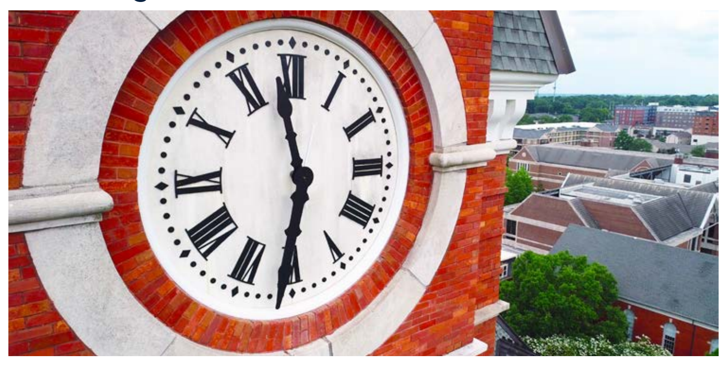
The Samford Tower clocks will receive acrylic faces and numerals, as well as new hands, to replace parts that have worn out over time. The repairs will take place Sept. 26-27.