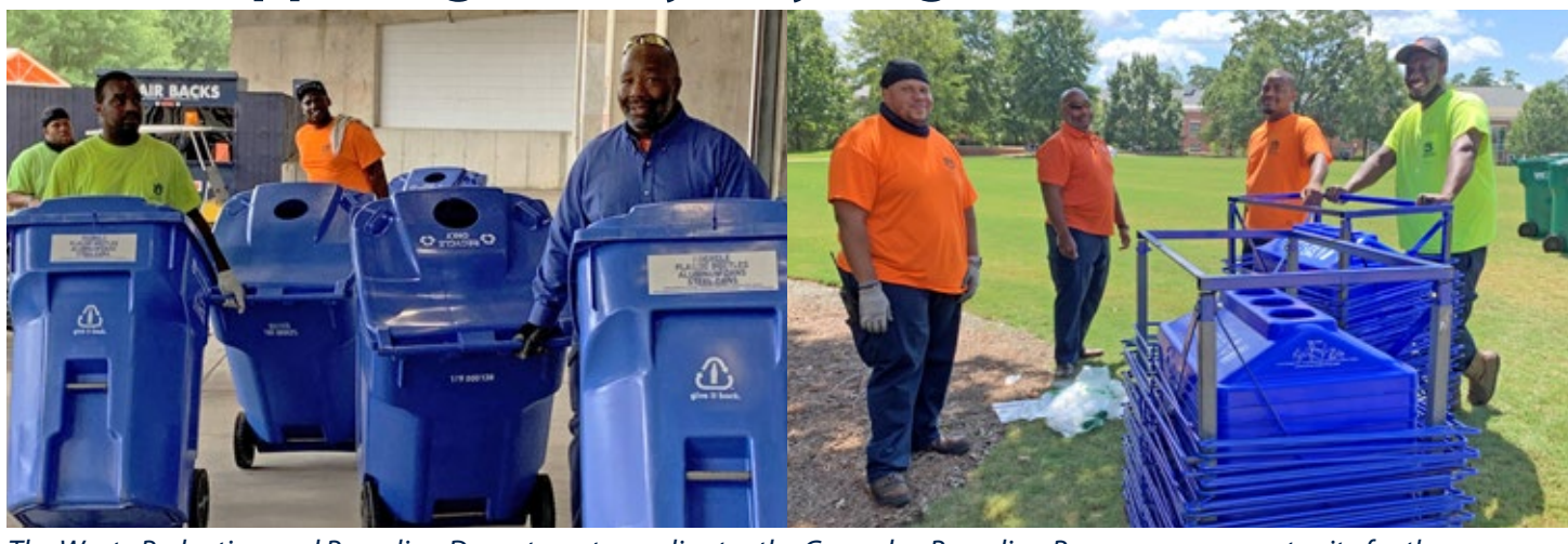
The Waste Reduction and Recycling Department coordinates the Gameday Recycling Program, an opportunity for the university to show the campus community that recycling and waste reduction are not limited to the home. Sporting events generate a large amount of waste, much of which can be recycled. At each home football game, WRRD places hundreds of additional recycling bins inside Jordan-Hare Stadium and around campus for fans to recycle plastic bottles and aluminum cans.