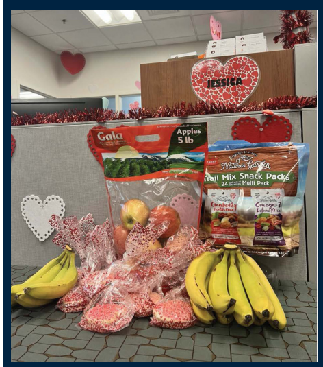
On Feb. 14, Facilities HR delivered "heart-healthy" snacks to the breakrooms and kitchens for all Facilities employees to enjoy in honor of Valentine's Day and American Hearth Month