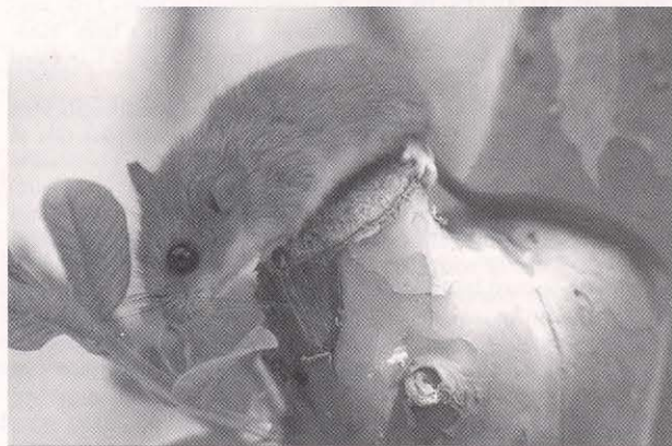
FIG. 1. Nyctomys sumichrasti from Chamela, Cuixmala Biosphere Reserve, Jalisco, Mexico.

Measurements of individuals of N. sumichrasti from across the range suggest a general increase in size from north to south (Bangs 1902; Goldman 1916, 1937; Goodwin 1969; Laurie 1953; True 1894). Average of external measurements (in mm; range and sample size in parentheses) of adult males and females, respectively, from Nicaragua are total length, 236 (225–246, 8), 230 (219–