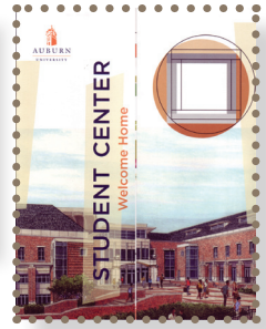
Lisa Berry's Student Union brochure cover design