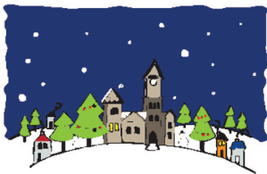
peace on the plains...