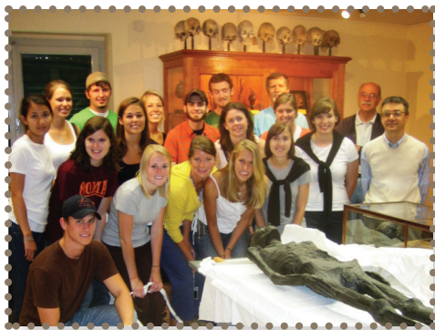
Human Odyssey students at the University of Pisa Medical School. Human skulls overlooking AU students overlooking remains of a 3000 year old Egyptian mummy.